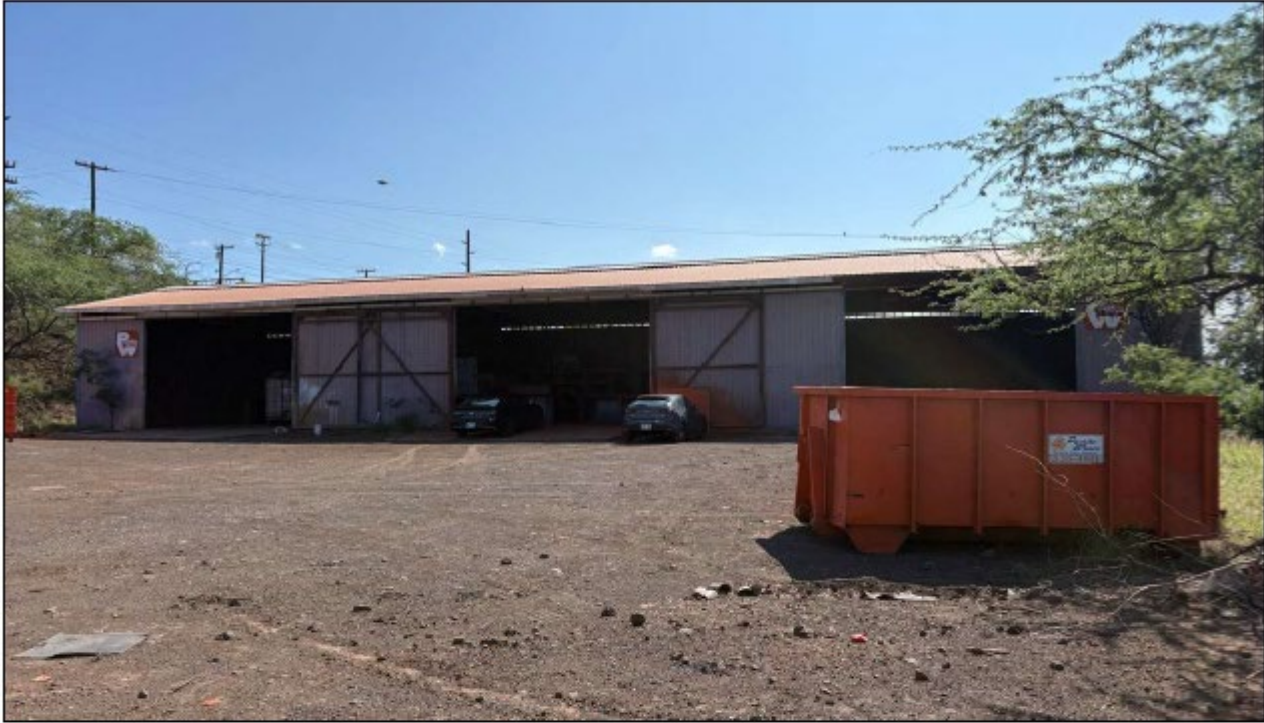
Warehouse on upper half of lot near the top of Maluokalani Street.