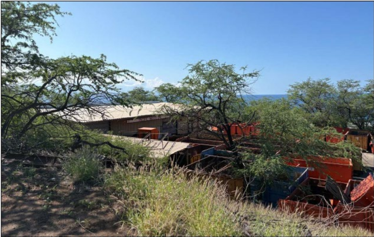
View overlooking lower half of the terraced lot, improved with warehouse and open space previously used for yard storage.