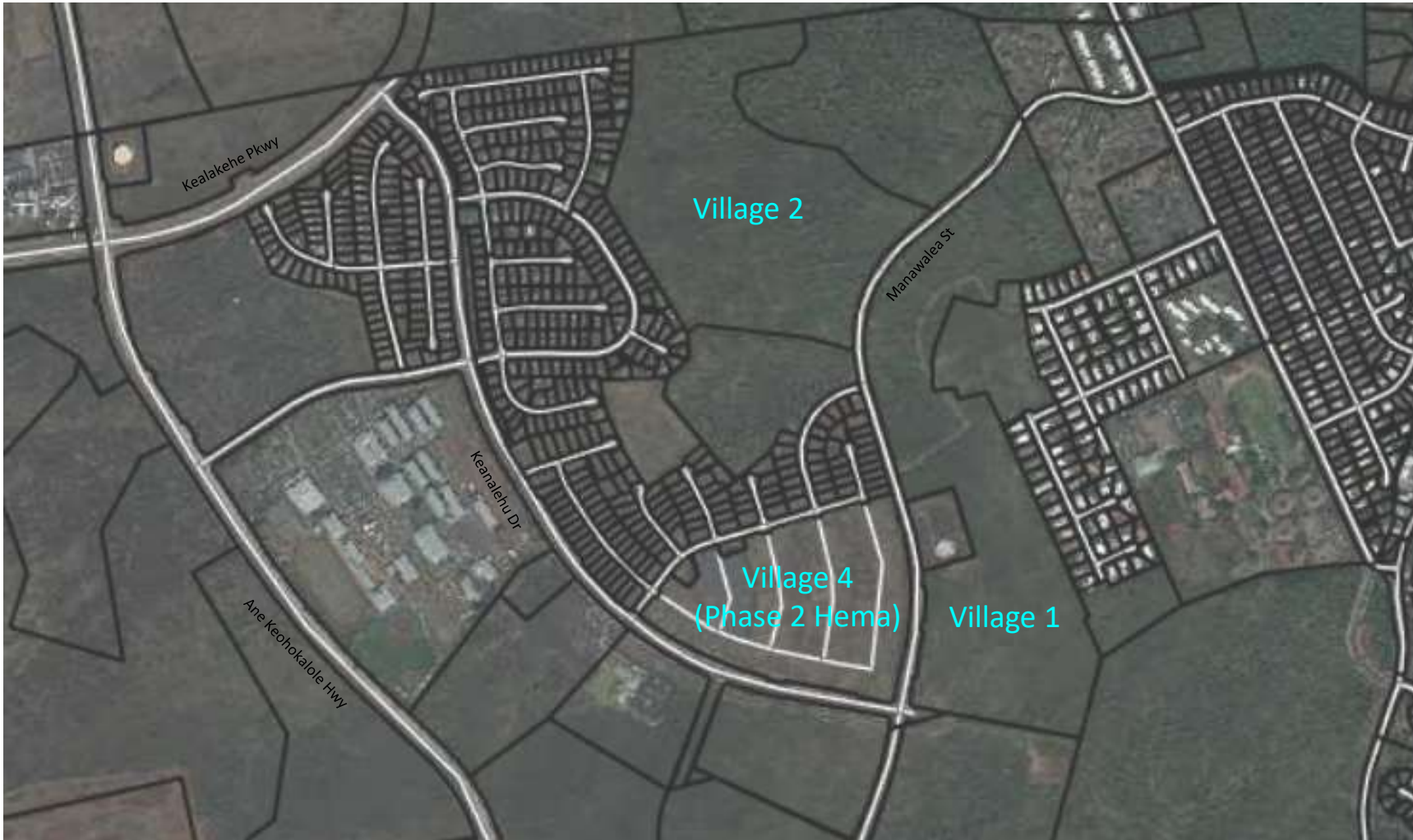
Villages of La'i 'Ōpua