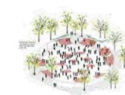
Local Market Day