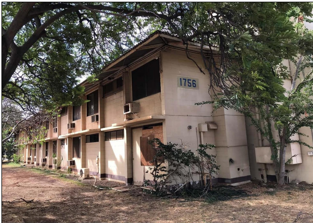
Figure 3. Oblique view of 1071