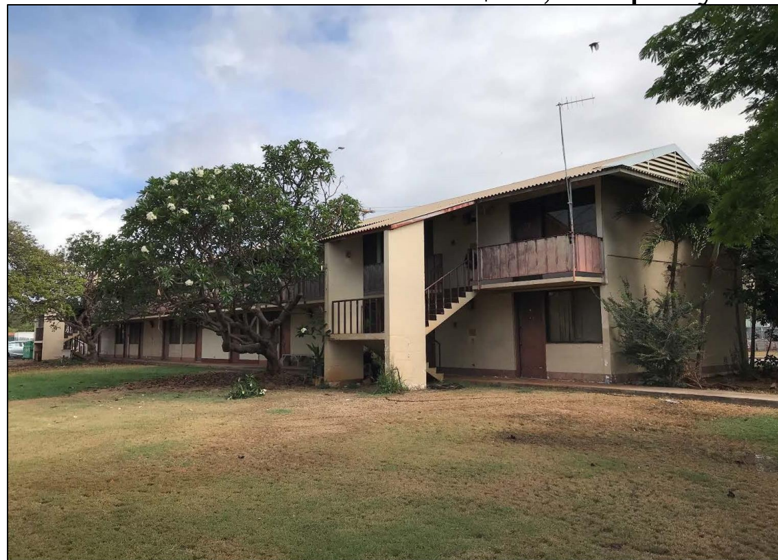
Figure 2. Oblique view of 1071 Yorktown St. View facing north