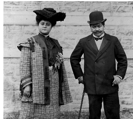
Kūhiō and Princess Kahanu photographed in St. Louis, Missouri in 1903 as part of the Louisiana Purchase expedition

Along with his new wife, Kūhiō left the islands on a self-imposed exile, traveling extensively through Europe. The pair traveled to Africa, where Kūhiō hunted big game and took part in the Boer War and on the side of the British.