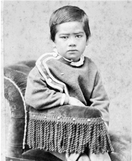
Kūhiō was nicknamed Prince Cupid while schooling in Honolulu

Kūhiō’s early education was in Honolulu at St. Alban’s College, known today as ʻIolani School, and Oʻahu College, now revered as Punahou School. He was a notable athlete competing in football, rowing, running, and bicycling. Kūhiō was also known as an avid horseman, an excellent marksman and was skilled in the Hawaiian martial art of “Lua.”