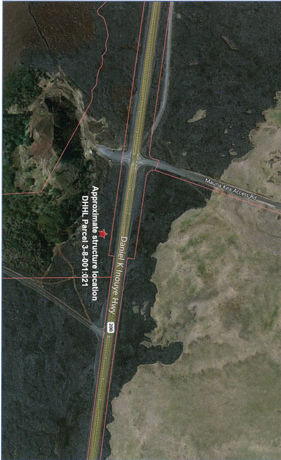
EXHIBIT A – MAP