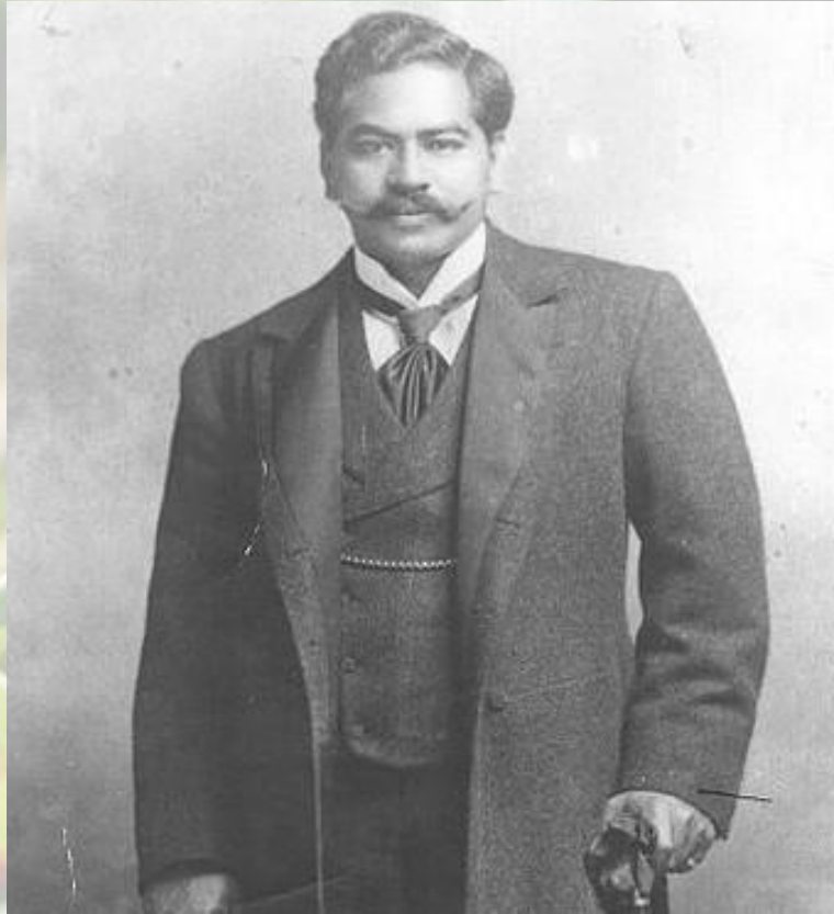
Prince Jonah Kuhio Kalaniana'ole