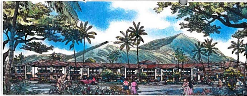
"THE NANAKULI VILLAGE CENTER" 89-102 Farrington Highway (Camp Andrews, Mauka side of Farrington Highway)

The Board of Director and members of the Nanakuli Hawaiian Homestead Commr Association cordially invites you to join us for our long - awaited Dedication Ceremc the future site of the Nanakuli Hawaiian Homestead Community and Commercial C called "The Nanakuli Village Center"