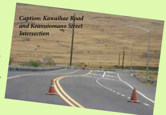
Caption: Kawaihae Road and Keanuiomano Street Intersection

The Lālāmilo Housing Phase 1 Kawaihae Road Improvements project includes traffic improvements to the Kawaihae Road / Keanuiomano Street intersection. The work includes adding a channelized left turn lane on Kawaihae Road for west bound traffic turning onto Keanuiomano Street and a west bound acceleration lane for traffic turning west onto Kawaihae Road from Keanuiomano Street. Improvements also include installing new guardrails, lighting, signs and pavement markings along Kawaihae Road.