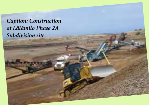
Caption: Construction at Lālāmilo Phase 2A Subdivision site

Jeffrey Fujimoto Department of Hawaiian Home Lands (808)620-9274