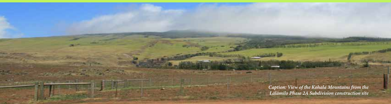
Caption: View of the Kohala Mountains from the Lālāmilo Phase 2A Subdivision construction site

ALOHA! This newsletter intends to provide information to the residents in the immediate vicinity of the Lālāmilo Phase 2A Subdivision and the Lālāmilo Housing Phase 1 Kawaihae Road Improvements projects with a progress summary of the projects, upcoming construction activities, and answers to any concerns or comments.