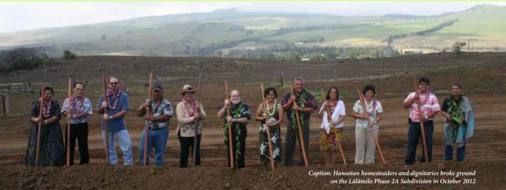
Caption: Hawaiian homesteaders and dignitaries broke ground on the Lālāmilo Phase 2A Subdivision in October 2012