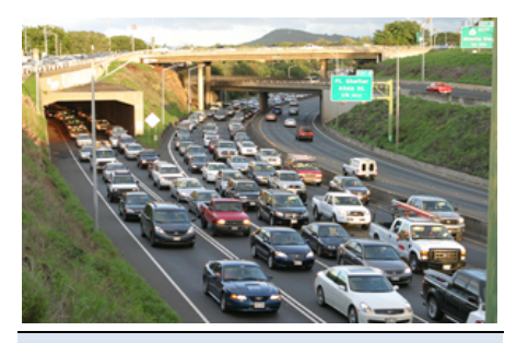
Restriping will add an additional lane in both directions to improve traffic flow, including at the Middle Street merge.

Unfortunately, this important effort to restore this portion of H-1 Freeway needs to be done. The majority of the work will be done at night to avoid weekday morning and afternoon rush hours.